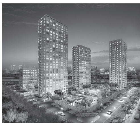
Happy Valley has a strategic location opposite to Saigon South golf course and the scenic river. On the other side, it borders a 5.4ha park and overlooks the Crescent Mall